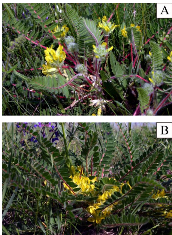
Fig. 1: Astragalus dasyanthus (A) and Astragalus exscapus (B) individuals in the association Astragalo austriaci-Festucetum sulcatae near Dóc.

Only a small proportion of the individuals of the two investigated populations could be identified as typical Astragalus dasyanthus or Astragalus exscapus by species identification keys according to Soó and Jávorka (1951), Jávorka (1962), Heywood (1964), Soó (1966), Farkas (1999), Simon (2000) and Király (2009) as follows: