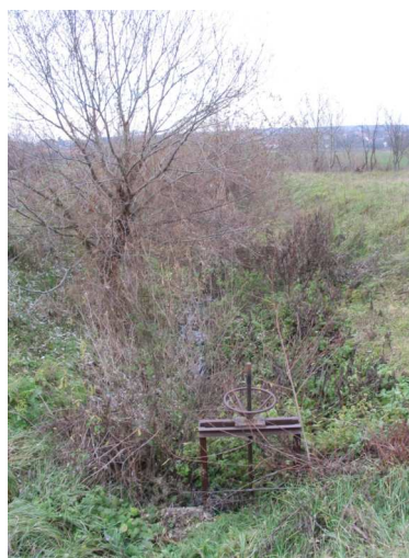
Photo 2: Poor water regulation in Bereg (upper) and Crişuri Plain (lower)