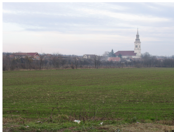
Photo 1: Food production on arable land in Bereg (upper) and Crișuri Plain (lower)

In Romania, there is a better acknowledgement of the basic, local products and services, including raw materials, freshwater, cultural value compared to Hungary (Fig. 2). This is supported by the fact that in Hungary people utilize the local resources, such as berries, corn and wood less. Furthermore, the not palpable and abstract services – genetic resources, water purification, water regulation, natural hazard regulation, recreation and ecotourism and aesthetic value – are more recognized in Hungary than in Romania. The interviews and the observation show that the performance of the provisioning and cultural services matches their recognition by people. This means that when people are aware of the importance of a service, the service also performs better, e.g. food supply from arable land. In contrast, the performance of the regulating services does not