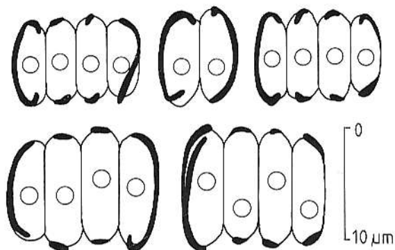
Fig. 2. Scenedesmus grahneisii (Heynig) Fott from the backwater at Tiszadob